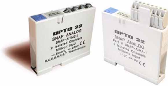
SNAP Isolated Analog Input Modules

Transformer isolation prevents ground loop currents from flowing between field devices and causing noise that produces erroneous readings. Ground loop currents are caused when two grounded field devices share a connection, and the ground potential at each device is different. Optical isolation provides 4,000 volts of transient